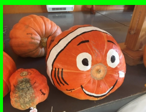
Some of the 2019 entries.