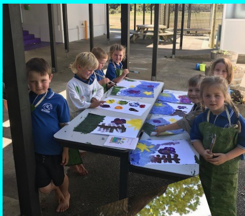
Budding Picasso's in Room 8.