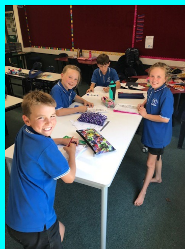
Our kids love their new classroom furniture.